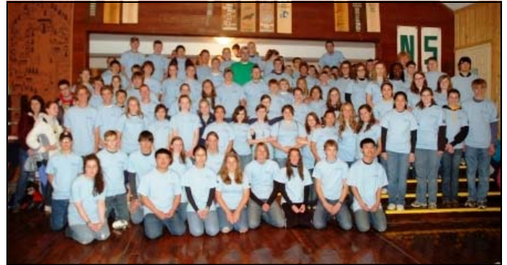
Michigan Envirothon teams at the 2010 State Competition held at Leelanau Outdoor Center on Lake Michigan

The winning Glen Lake High School team addressed raptor rehabilitation for their community outreach project. Their project included installing raptor houses throughout Leelanau County to aid the locally threatened Screech Owl and American