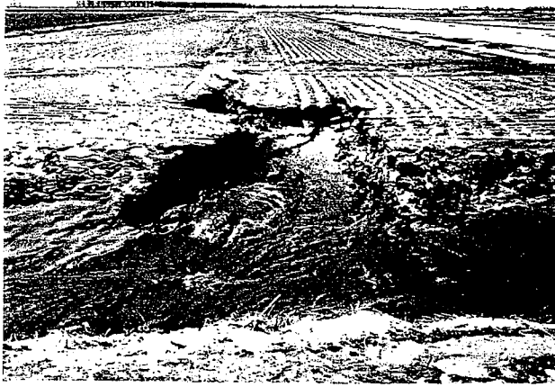
Figure 3. Shallow gully erosion on flat land in Saginaw County. Erosion is occurring where water enters road ditch. This resulted after road was improved. No vegetation was ever established on the ditch banks.