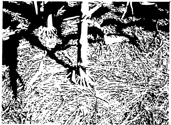
Figure 4. No-till corn planted in sod. No-till methods represent the most recent innovation in erosion control in fieldcrop production.

Very few crop producers in Michigan use the concept of growing cultivated and close-growing or