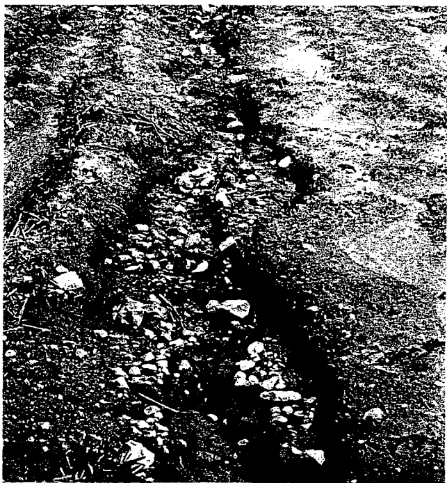
Figure 2. Rill erosion on fall-plowed hilly crop land in Ingham County.

A raindrop hitting a wet soil causes a slight depression with compacted soil material below the center. The force of the drop detaches minute particles from the soil mass and moves them away from the drop area. In a heavy rain on summer-fallowed