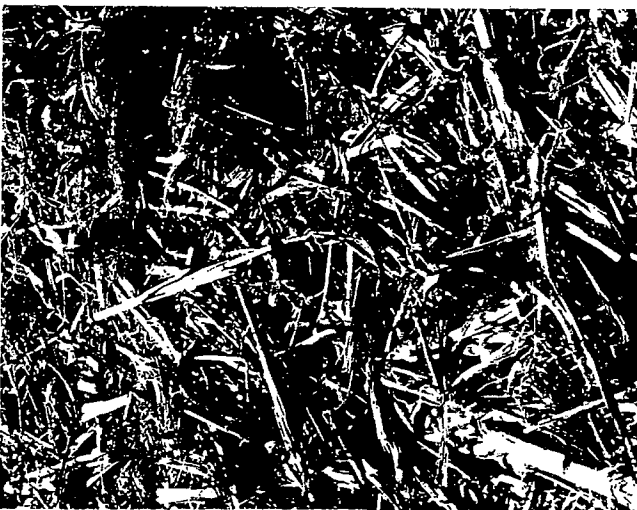
Figure 6. Corn residues after the harvest of a high yielding crop. This picture shows 5,790 pounds per acre of residue. Little erosion is likely under these conditions.

Cover crops can be used to reduce erosion where crop residues are removed or sparse. A cover crop is one grown just to protect the soil. Oats planted in late summer-plowed fields provide a blanket to the soil while they are growing as well as after they are frozen. Rye is the old standby for those who do not fall plow. With modern herbicides, such use of rye is now feasible.