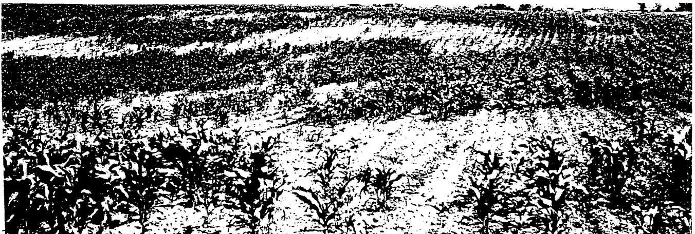
Figure 1. Variable stands of corn reflect severely eroded areas, which results in wasted seed and fertilizer and in reduced yields. Furthermore, with such stands, the soil in the eroded area remains unprotected for the entire season.

Michigan's citizens are all affected by soil erosion. Obviously, farmers are hurt when erosion oc-