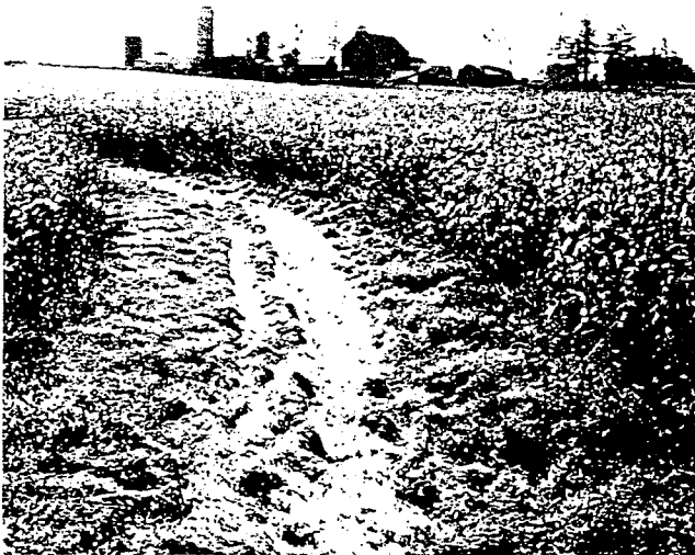
Figure 8. Sod waterway in corn field prevents erosion. The best waterways are designed by engineers who can interpret crop requirements, soil variability and surveying and hydraulic principles.

contour tillage is not possible in many parts of Michigan because of short, irregular slopes. However, tilling across the slope as much as possible reduces erosion in the parts of the field where the tillage operations are on the contour.