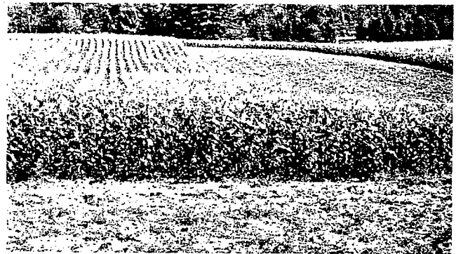
Figure 5. Strip-cropping in Montcalm County. Corn and sod strips provide erosion control on 5 to 10 % slopes.

sod crops in alternate strips across a slope (Figure 5). In rolling topography, especially where slopes are long, this practice has merit because runoff from the cultivated area is retarded by the close-growing crop resulting in greater absorption of runoff and deposition of sediment.