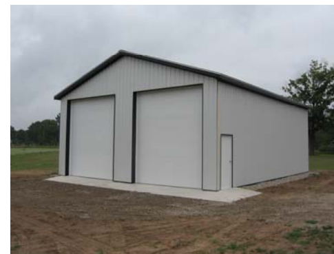
This photo shows an Agrichemical Containment Facility completed in 2007 with cost share from NRCE; design and construction site inspections done by the Van Buren Conservation District. Structures such as this are dedicated solely to storing and mizing agricultural chemicals (pesticides and fertilizers)/ It has a sealed concrete floor that is sloped in the middle to collect any potential spills or leaks. This practice significantly reduces risks of pollution to groundwater and surface waters.