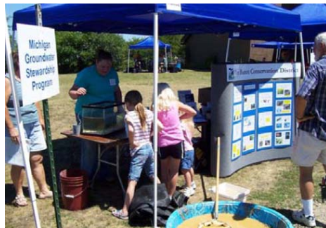
Eraeseq uismodo lendreet con