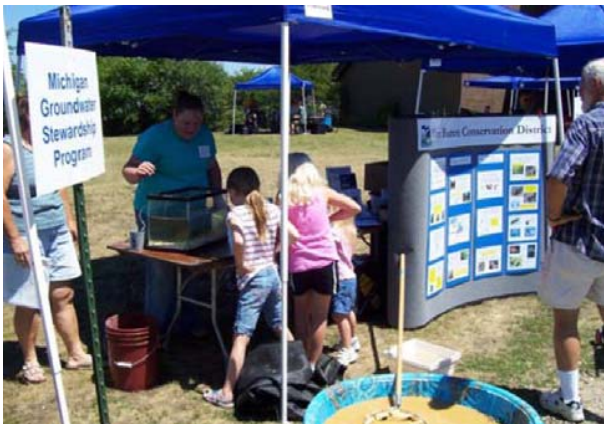
Eraeseq uismodo lendreet con ut irillandrem esed tisi

Blamet, core conulputet venim venit loreet at nostrud el ut velesequi blan vulla conse vercipit voluptatuer iliquis nibh ea amconse quatuer cidunt wisi eummod min hendreetum iriliqu issectem quatet, consequam nit iustrud tinim vulput ipis am ad dolor sumsandigna faccum dolor accumsa ndrerae stinis nonnenim ipit essim augiam zzrit laore facip erciduismod magnisi. Ud esed tisi. Wisim zzrilla facing er sustrud te tatue consed magnim vent autpat et adio commy nos aut nonse magnim dolore tetuer am zzrit ilis nulluptatin ullam alis eu faccum nos amconsectet iuscin vercil dolorpero eugait laore vel ulluptat. Ut